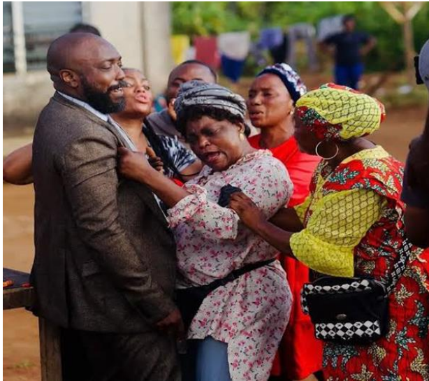
Figure 8: Scene Jedidiah defending a woman from her abusive husband