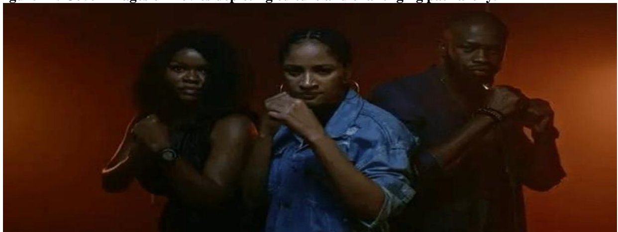
Figure 11: Cover images of movies depicting culture and challenging patriarchy.

The cultural impact of Indigenous female filmmakers cannot be overstated. Their films celebrate Indigenous identities, traditions, and languages, while also challenging patriarchal norms and advocating for women's rights. By bringing Indigenous stories to a global audience, these filmmakers are not only preserving their cultural heritage but also promoting a more inclusive and diverse representation of African experiences (Wane, 2008).