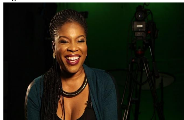
Figure 2: Kemi Adetiba

Adetiba's work is notable for its intricate plotlines and strong character development, which have earned her a loyal following and critical acclaim. "King of Boys" stands out for its portrayal of a complex female lead who embodies both vulnerability and power, providing a nuanced depiction of women in positions of authority. Adetiba's films have been praised for their bold storytelling and for pushing the boundaries of what is expected in Nigerian cinema.