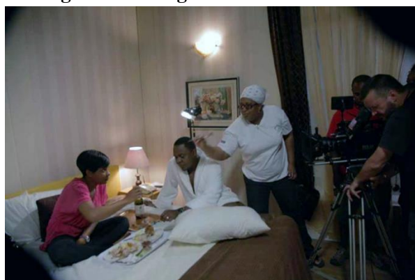
Figure 4: Mildred Okwo on set with cast making The Meeting

In "The Meeting," Okwo addresses the bureaucratic challenges and societal pressures faced by individuals in Nigeria, using humour to highlight serious issues. Her ability to tackle social themes with a light-hearted approach has made her films accessible and engaging, contributing to the diversity of narratives within Nollywood. Okwo's work underscores the importance of representation and the power of film to reflect and critique societal norms.