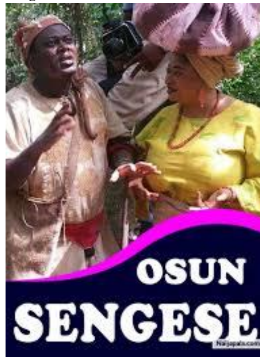
Figure 10: Ronke Oshodi-oke casting in Osun Sengese

Ronke Oshodi-Oke is one of the prominent figures who have successfully used YouTube to share her films with a global audience. Known for her engaging storytelling and strong female characters, Oshodi-Oke has produced several films that address social issues and celebrate Nigerian culture. Her ability to connect with audiences through relatable narratives and authentic portrayals of Nigerian life has earned her a loyal following on YouTube.