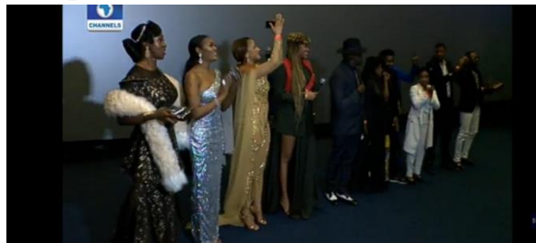
Figure 3: Kemi Adetiba with cast on King of Boys premiere