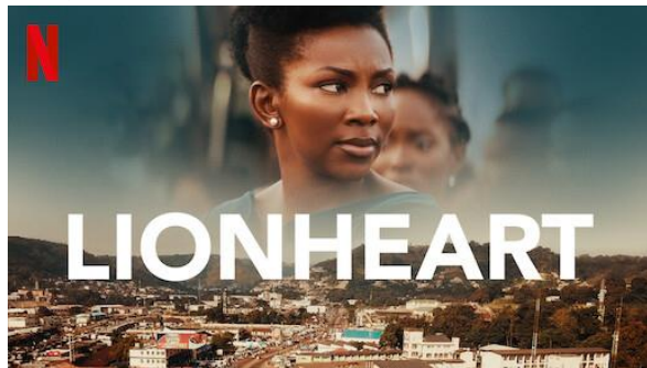
Figure 1: Genevieve Nnaji: A Trailblazer in Nollywood

Genevieve Nnaji's transition from actress to filmmaker marked a significant milestone in Nigerian cinema. Her directorial debut, "Lionheart" (2018), was a groundbreaking film that gained international acclaim and became the first Nigerian film to be acquired by Netflix. "Lionheart" tells the story of a woman navigating the male-dominated business world, reflecting broader societal challenges faced by women in Nigeria (Nnaji, 2018). Nnaji's success with "Lionheart" not only showcased her talent as a filmmaker but also opened doors for other female directors in the industry.